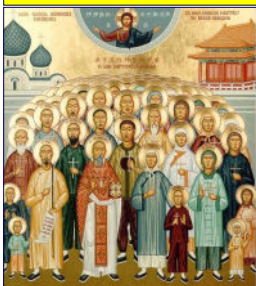
St Augustine Zhao and Companions July 9 Martyr Saints of China

Dear Parishioners our New parish email address is : parishoffice@christthekingparish.org.nz Kindly start using our new email from now on. The old email address will no longer be in use very soon.